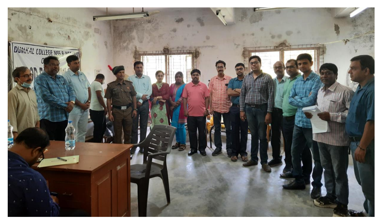
Teachers and Staff involved in the Camp